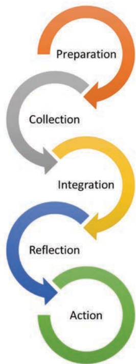
Figure 2. The stage-based model of personal informatics systems (after [6]).

engagement. For example, when deeply engaged in a task to the point of experiencing flow, a person's subjective experience of time is typically altered [3]. Thus, people have historically relied on visual or auditory signals to estimate, determine, or track time. Initially, these time signals were derived from nature: the position of the sun in the sky or the sound of a rooster in the morning. Eventually, these time signals became technology-based. Many people now rely on displays, or signals, of time that derive from our world of pervasive devices: digital time displayed on a device screen, a notification sound from a calendar application.