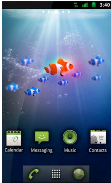
Figure 1. BeWell's ambient display of sensed health information, including representations of physical activity (the speed of the clownfish), sociality (the number of blue fish in the surrounding school), and sleep (the amount of light shining through the water).

$300 billion a year in absenteeism, diminished productivity, employee turnover and direct medical, legal and insurance fees" [2]. We have seen evidence of the relationship between the use of computing technologies and stress in our own empirical studies of information workers, as well, noting a correlation between use of e-mail and increased stress levels (as measured by heart rate variability) [6].