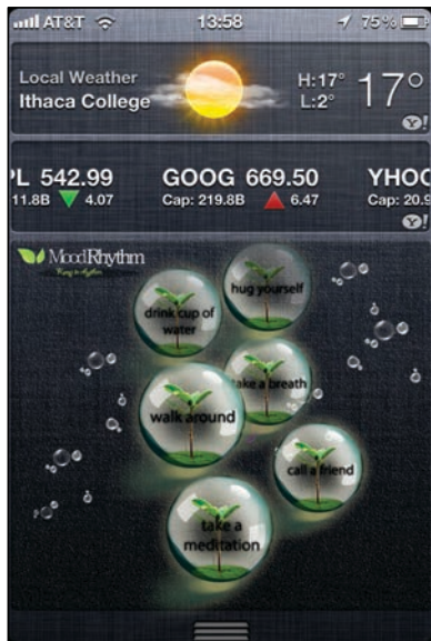
Figure 3. An early-stage mockup of our MoodRhythm app, designed to assist individuals with bipolar spectrum disorder in monitoring and managing their stress levels and moods.

self-reflection, embedding this kind of sensed health information in the tools that are already used everyday may help to prolong engagement with the system and enable self-reflection about health and stress in a more grounded, and, therefore, more actionable manner.